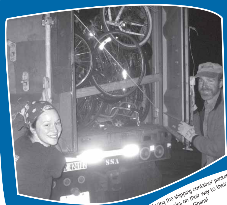
Closing the shipping container packed full of bicycles on their way to their next adventure in Ghana!